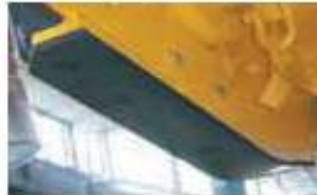
Replaceable heavy duty wear skids.