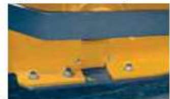
A slot in both side walls, permit a quick release of the rotor for replacement or maintenance.