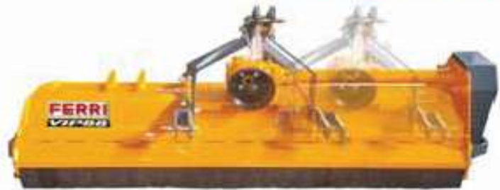
VIP 88 - Central or Offset mowers