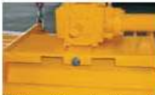
Belt transmission can be tensioned mechanically by shifting the shaft and gearbox through the bolts provided (see above). In this way the tensioning is very precise.