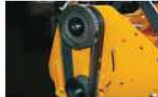
Three SPBX belts transmitting 52 kW power. The drive pulley is coupled using tapered spline.