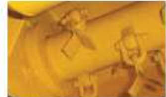
The rotor shaft is well protected by an end shield and a protection ring. This avoid that dust and debris enter the bearings area.