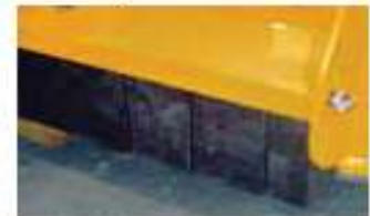
Front protection with heavy duty rubber flaps. These flaps are pivoting around a steel shaft therefore they will let the vegetation enter the mulching area.