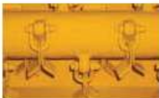
Our flails are mounted on a single drop forged support (1" thick) the pivoting bolt works on a 1" surface. HD flails are 5/32" thick.