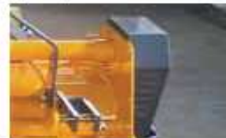
The belt transmission box is well protected all over no risk that dust and debris reach the transmission system causing quick wear of belts and pulleys