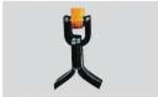
Articulated "Y" Blades for grass and twigs. Max 1". Heavy duty (5/32" thick)