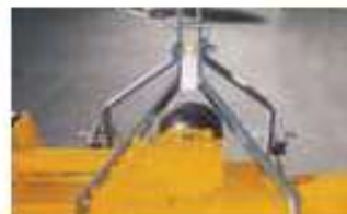
Three point linkage made of steel bars 5/8" thick.