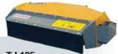
TJ 125 direct drive