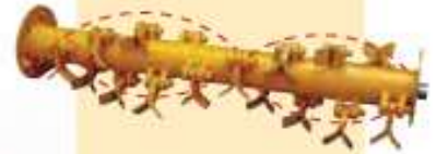
"OVERLAP" spiral rotor with two spiral rows.