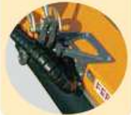
Cast forged arm brackets and fall head linkage.