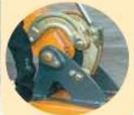
Cast forged arm brackets and tail head linkage.