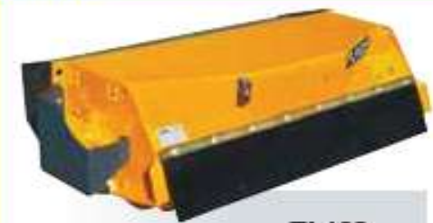
TI 120 direct drive