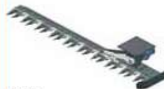
CS 150 Cutter bar max cut 1/2" - width of cut 59"