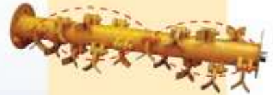
"OVERLAP" spiral rotor with two spiral rows