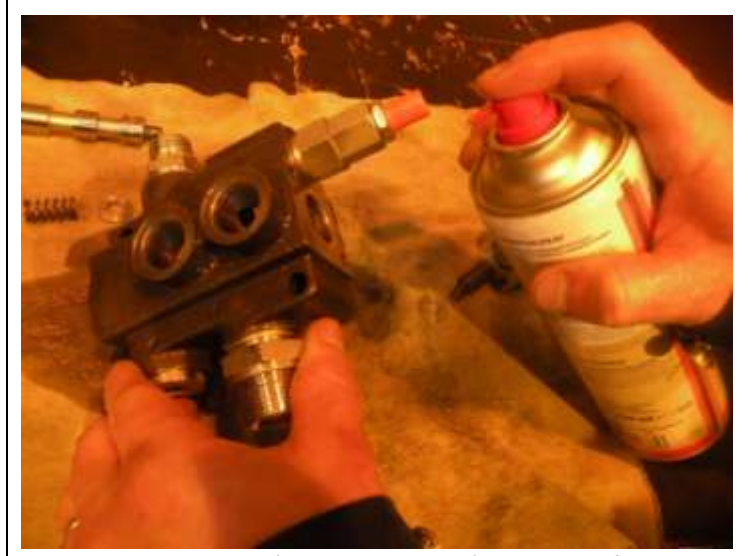
13. Spray a cleanser (e.g. Brake Spray) into valve from every opening and blow also pressure air at the end. Then mount the pieces in reverse order.