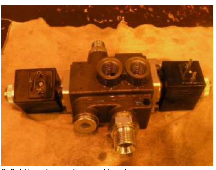
9. Put the valve on clean workbench.