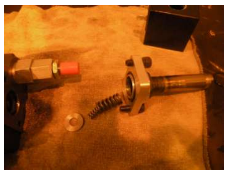
11. Remove the shaft of inductor, springs and washer. (N.B there's only 1 spring on the other side).