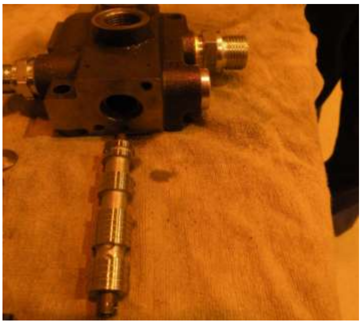
12. Pull the shaft off. You can also test that the shaft isn't too tight to move.