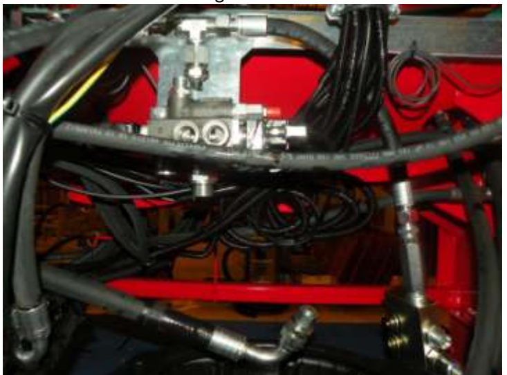
6. Mount ½" plug to T-branch like in figure.