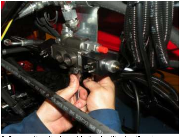
8. Remove the attachment bolts of split valve (2 pcs).