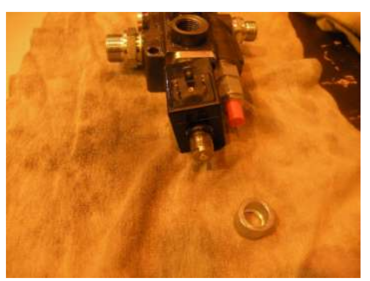
10. Remove the attachment nut of inductor and pull inductor and O-ring off (from both side of shaft).