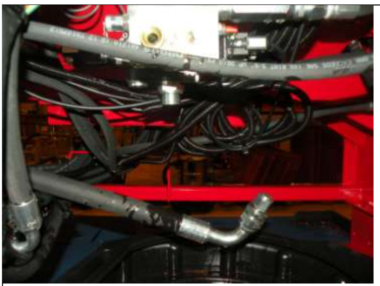
4. Remove the hydraulic hoses of speed valve and mount the plug (3/4") for the hose, which goes to hydraulic oil tank. Like in figure above.