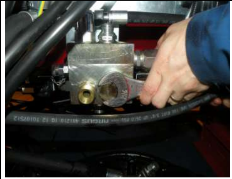
5. Remove the attachment bolts of speed valve and remove the speed valve from the split valve.