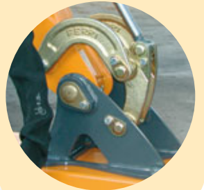
Drop forged arm brackets and flail head linkage.